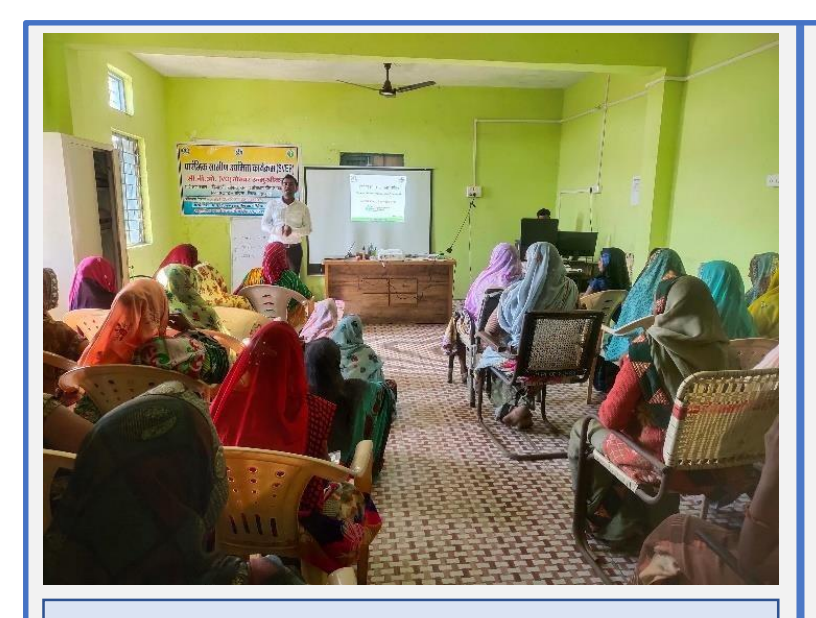
65 CBO participants were trained on book keeping and record maintaining at Thandla block of Madhya Pradesh