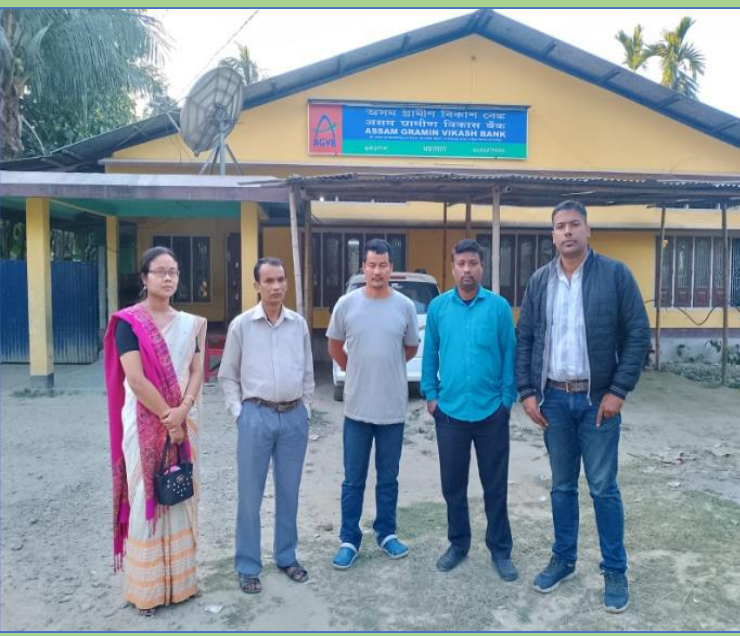
Convergence with banks to avail Mudra loan in the state of Assam

7 SVEP supported entrepreneurs from Pub-Mangaldai Block received Mudra loan amounting to Rs. 14 Lakhs (2 Lakhs each) from Assam Gramin Vikas Bank, Bhakatpara through convergence. Similar amount of efforts are being made in Sidli -Chirang block under close supervision by SVEP mentors.