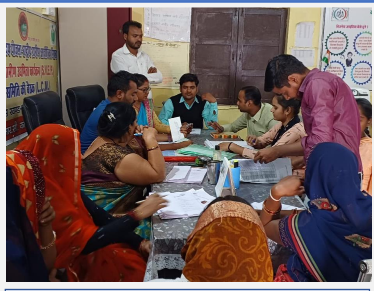
42 business plans approved during the BRC Meeting organized at Kadaura block of Uttar Pradesh