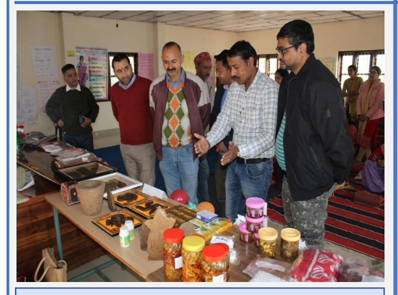
90 members of community based organization of Mandi Sadar block of Himachal Pradesh were given basic training on book keeping and CEF management in 3 batches.