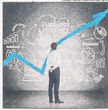
Investors becoming value-centric