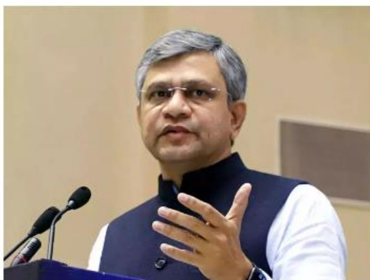
IT minister Ashwini Vaishnaw

Calling social media a "very powerful medium," Union IT minister Ashwini Vaishnaw on Tuesday said that how to make it accountable is a "very valid question" and that an ecosystem is being created across the globe and in India for the same. Self-regulation is a first step in the direction of making social media accountable, followed by